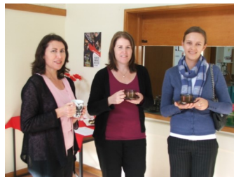
Open Day at Volunteering Auckland on 23 June 2010 on Volunteer Awareness Week

These results were drawn from preliminary analysis of the December quarter survey results. Trend data on the giving of time and money will become increasingly available on the OCVS website over the coming months. This follows significant community sector interest in the 2007 and 2008 How Do New Zealanders Give? annual research reports. The future online publication of more timely quarterly data, collected through Nielsen Media Research's Panorama survey, will help inform the work of the Generosity Hub and a range of other community organisations attempting to better understand New Zealanders giving activity.