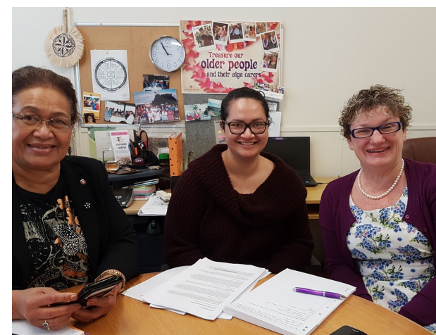
NGO Consultation with TOA Pacific October 2017