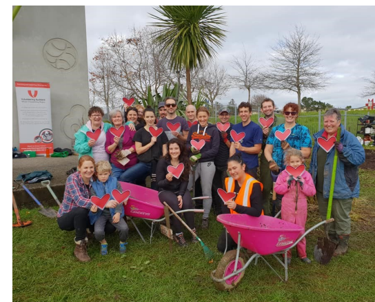
VA Board, Staff and family volunteering at the community gardens at HubWest June 2018