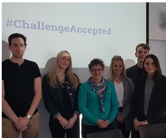
AUT Outside the Square student team #ChallengeAccepted —youth volunteer engagement with NGOs August 2017